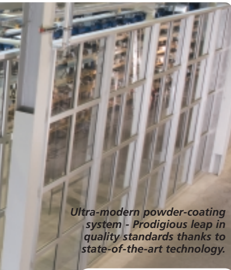
Ultra-modern powder-coating system - Prodigious leap in quality standards thanks to state-of-the-art technology.