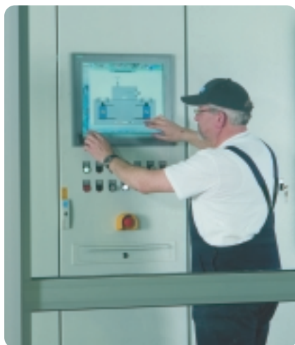
Genuine added-value - JACOB PIPEWORK SYSTEMS now provides the latest generation of powder-coating as standard for its products.

This „state-of-the-art“ equipment provides Jacob’s customers with a well-rounded package of genuine added value: The plant is the most modern equipment available and operates to the greatest possible extent on an automatic basis, creating external plus internal