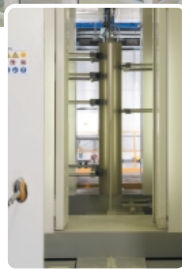
High tech in action - Mobile lances guarantee a powder coating of consistent high quality, even on the inside of the pipe.

This performance criteria alone represents a significant innovative advance in quality. It allows the customer to use JACOB PIPEWORK SYSTEMS coated pipes in ATEX applications, without the need for additional earthing lugs and cables.