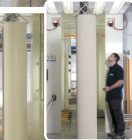
Quality control - High-quality powder-coated pipes leave the spray cabin.

combine existing primed components with our new powder-coated parts.